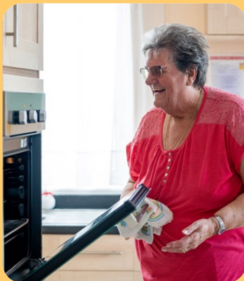
Mablethorpe OAP Association